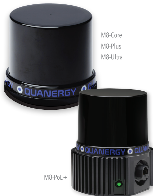
M8-Core M8-Plus M8-Ultra